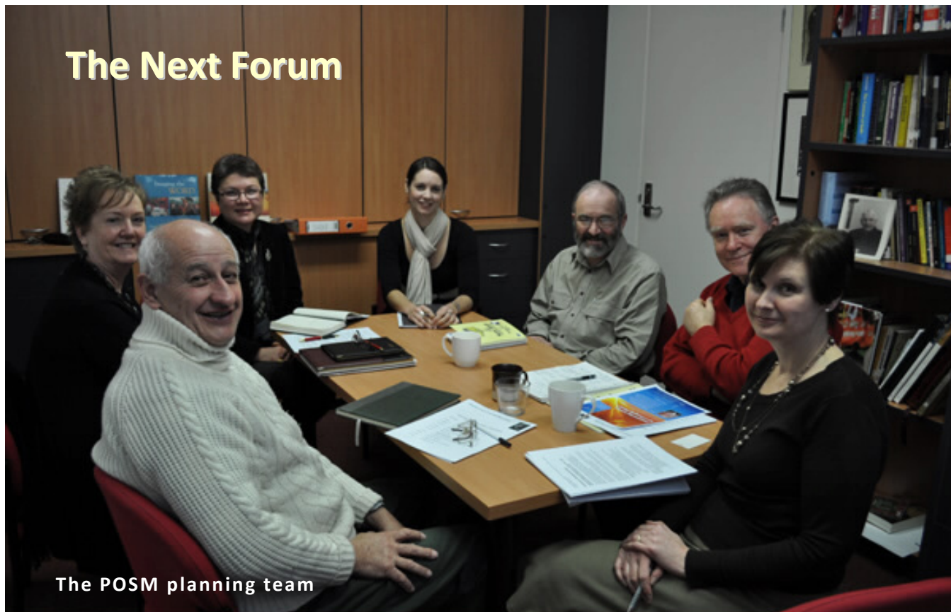
The POSM planning team

When the first POSM newsletter was produced in December 2008 there were quite a few references to schools, including the need to continue the discussion about ... 'better connection between parish and school.'