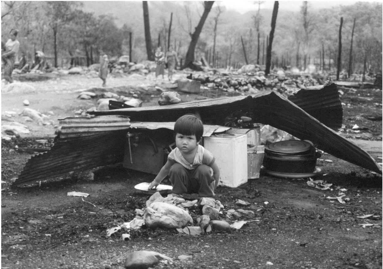
A Burmese refugee child shelters in the ruins of her house after soldiers destroyed their refugee camp